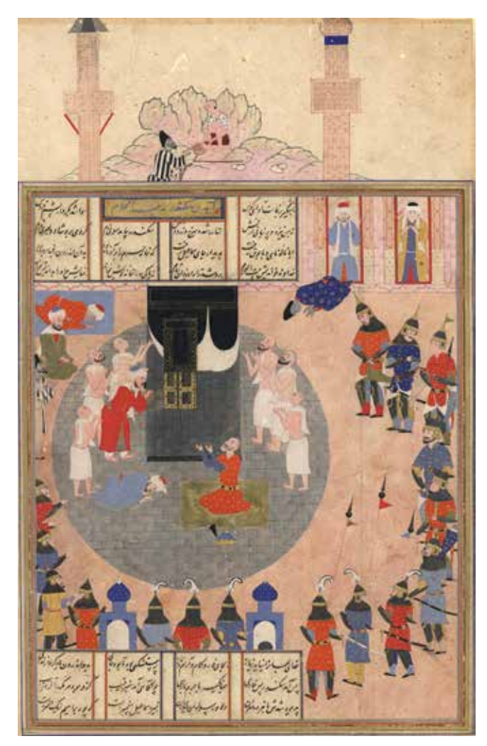
Plate 3 Alexander visits the Ka'ba, from the Shahnama of Firdausi, mid-16th century. The Nasser D. Khalili Collection of Islamic Art (MSS 771)

possessing eternal sanctity and cosmological spatial holiness lying directly under God's throne. God's order that Adam perform the Hajj is an integral part in establishing a portrayal of the Hajj as a universal expression of monotheism.