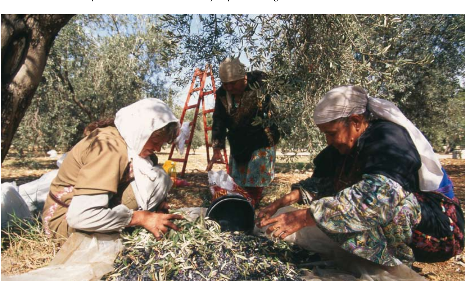
185 Muslim women harvesting olives on the Haram al-Sharif

The Mount is not only too small to allow for physical partition; one cannot even partition this small piece of holy land diachronically, allotting its past to the Jews, its future to the Christians, and its present to the Muslims: all three want to possess it throughout time. Let us only hope, then, that we are not living, as did Jews, Christians, and the first Muslims, at the End of Time. Regarding the Temple Mount, like so much else, the complexity of cultural memory offers safer horizons than the simplicity of eschatological beliefs.