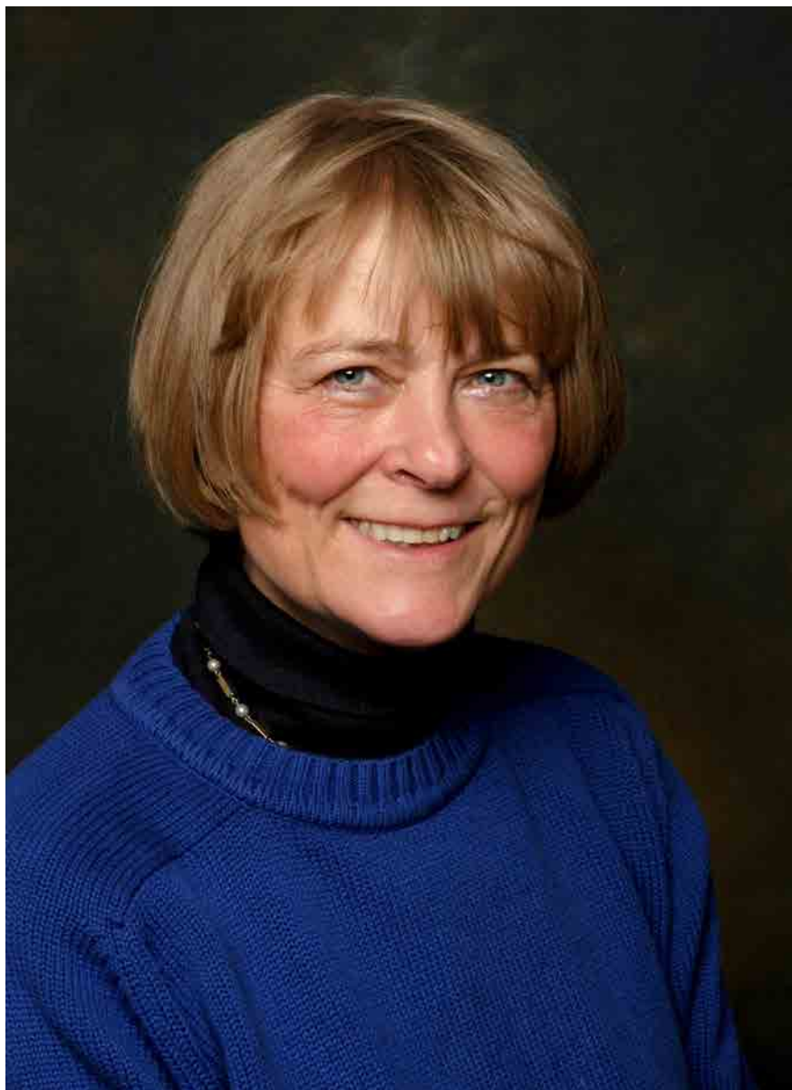
Patricia Crone, 29 January 2004