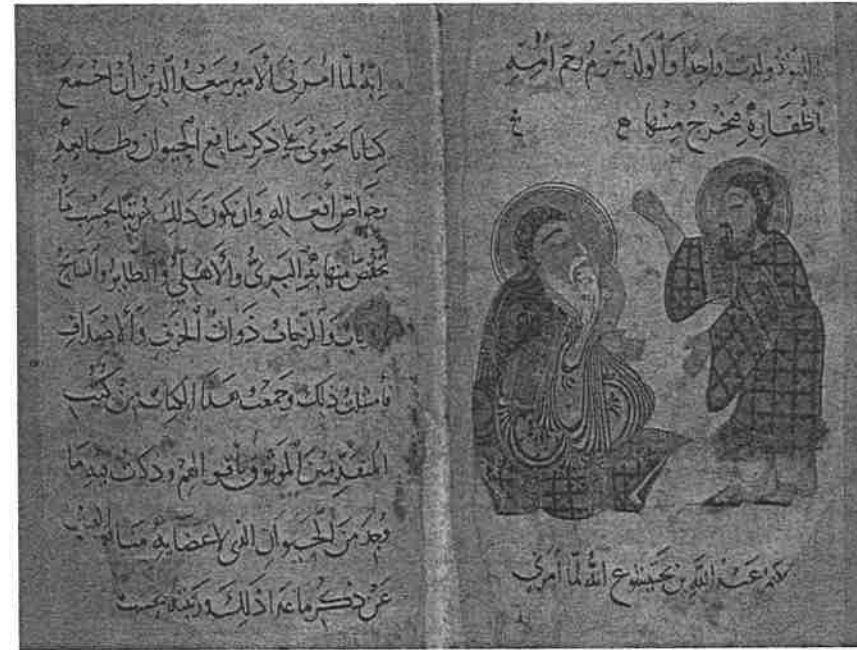
Fig. 3. Ibn Bakhtishū' and the Emir Sa'l ad-Dīn in Discussion

In the thirteenth-century Arabic manuscript containing the work by Ibn Bakhtishū' called Animals and Their Uses , the illustration portrays the author, who was from a famous Christian family, in a colloquy with his Muslim patron. Such conversations between the members of the intelligentsia of the several religious communities were common in 'Abbasid Baghdad. (British Library Oriental Manuscript 2984, thirteenth-century Arabic, ff. 101v–102. Arabic translation of Aristotle's "Animals and Their Uses," by permission of the British Library.)