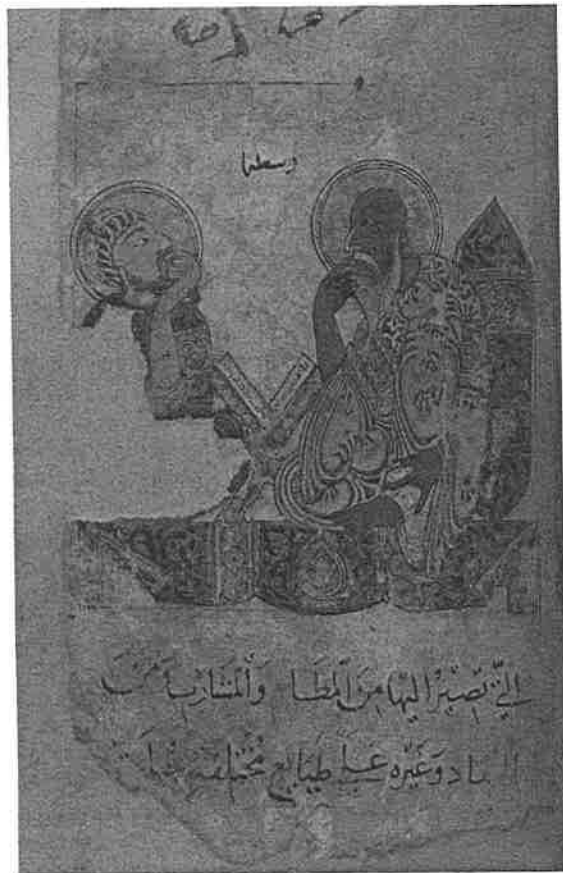
Fig. 4. Aristotle and Alexander the Great Taken from the pages of a thirteenth-century Arabic manuscript now in the British Library and containing a work called Animals and Their Uses , by the Christian physician and scholar Ibn Bakhtishū', the illustration shows Alexander the Great at the feet of his teacher Aristotle. Both Alexander and Aristotle were celebrated by Jewish, Christian, and Muslim scholars in 'Abbasid Baghdad. (British Library Oriental Manuscript 2784, thirteenth-century Arabic, f. 96. Arabic translation of Aristotle's "Animals and Their Uses," by permission of the British Library.)