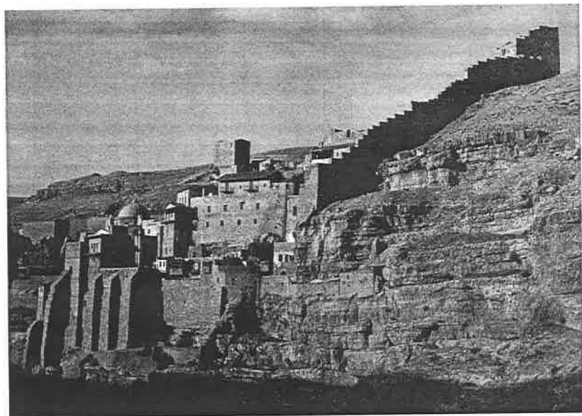
Fig. 2. Mar Sabas Monastery in the Judean Desert Established in the year 483 CE by St. Sabas (439–532) and long known as the “Great Laura,” Mar Sabas was home to many of the Greek, Syriac, Christian, Palestinian, Aramaic, and Arabic-speaking monks who contributed so much to Christian intellectual culture in Islamic times. The monastery flourishes to this day.

ishing translation culture in the Judean desert monasteries in the eighth century. 23