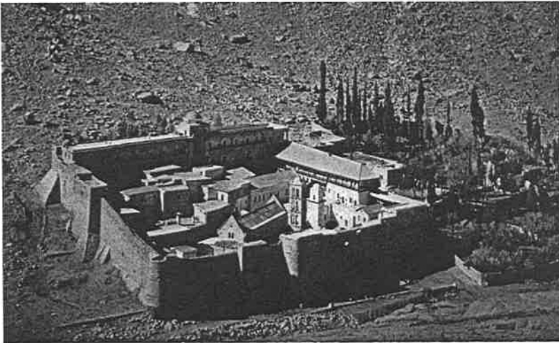
Frontispiece. St. Catherine's Monastery at Mount Sinai While the monastery at Sinai was dedicated to the martyr St. Catherine of Alexandria (fourth century) after the ninth century, it was founded in 527 CE and dedicated originally to the Mother of God. The monastery's library now houses one of the largest collections of Christian Arabic manuscripts, a number of them written in the monasteries of Palestine, the earliest of them dating from the second half of the eighth century CE.